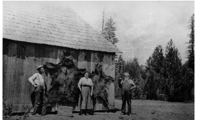
Figure Caption: These bear hides were proudly hanging on the side of a barn at Berdan's, circa 1890.